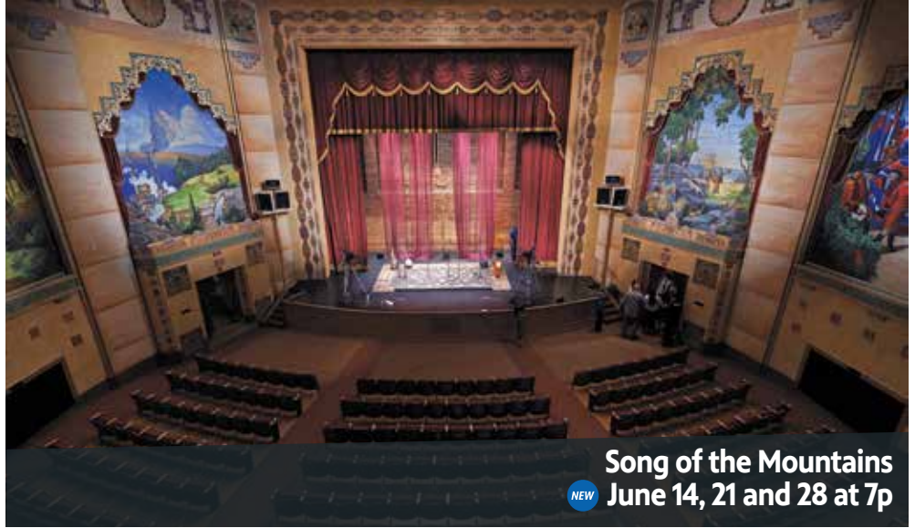
Song of the Mountains June 14, 21 and 28 at 7p