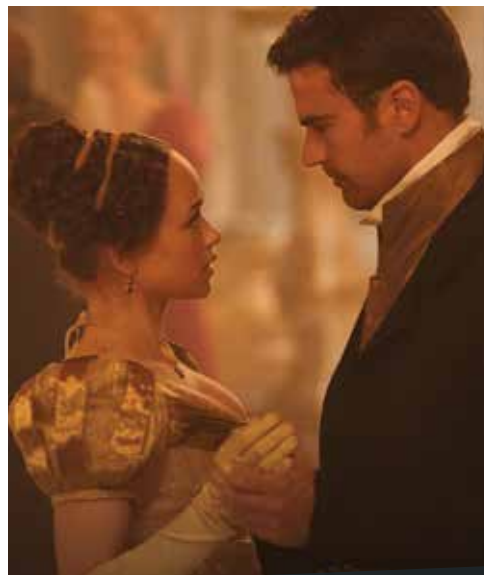
Sanditon on MASTERPIECE June 11, 18, 25 at 9p and 10:15p