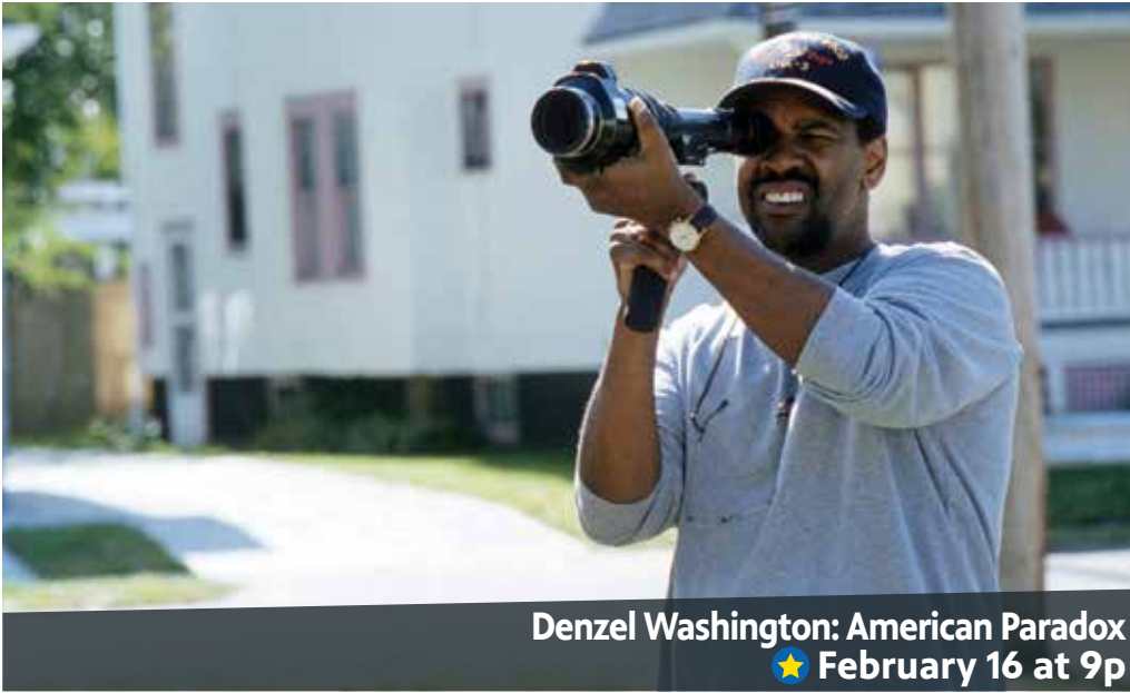
Denzel Washington: American Paradox ★ February 16 at 9p