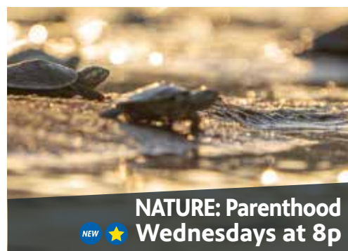
NATURE: Parenthood Wednesdays at 8p

9:35p All Creatures Great and Small On MASTERPIECE: Fixes #5611