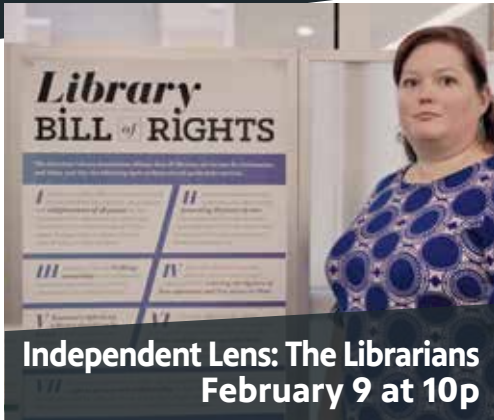
Independent Lens: The Librarians February 9 at 10p