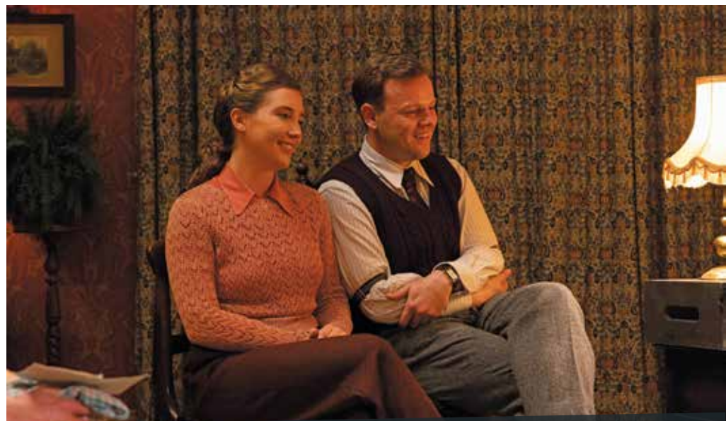
All Creatures Great and Small On MASTERPIECE: Jenny Wren NEW ★ February 1 at 9p