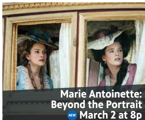
Marie Antoinette: Beyond the Portrait NEW March 2 at 8p