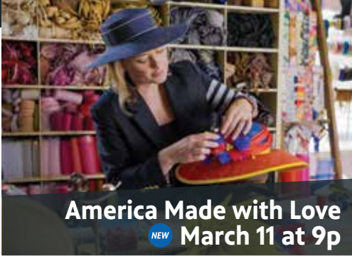
America Made with Love NEW March 11 at 9p

2:30p This Old House: Concord | Planting for the Future #4310