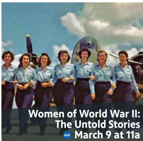
Women of World War II: The Untold Stories March 9 at 11a