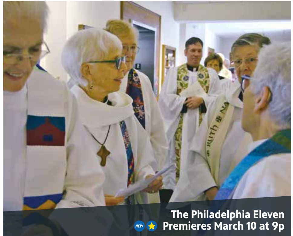
The Philadelphia Eleven Premieres March 10 at 9p

Great Performances: Andrea Bocelli 30 th — The Celebration will showcase the tenor superstar's beloved 30-year repertoire on March 7 at 9pm. Jon Batiste, Sofia Carson, Lang Lang, Christian Nodal, Ed Sheeran, Nadine Sierra and Shania Twain are just a few of the