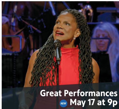
Great Performances NEW May 17 at 9p